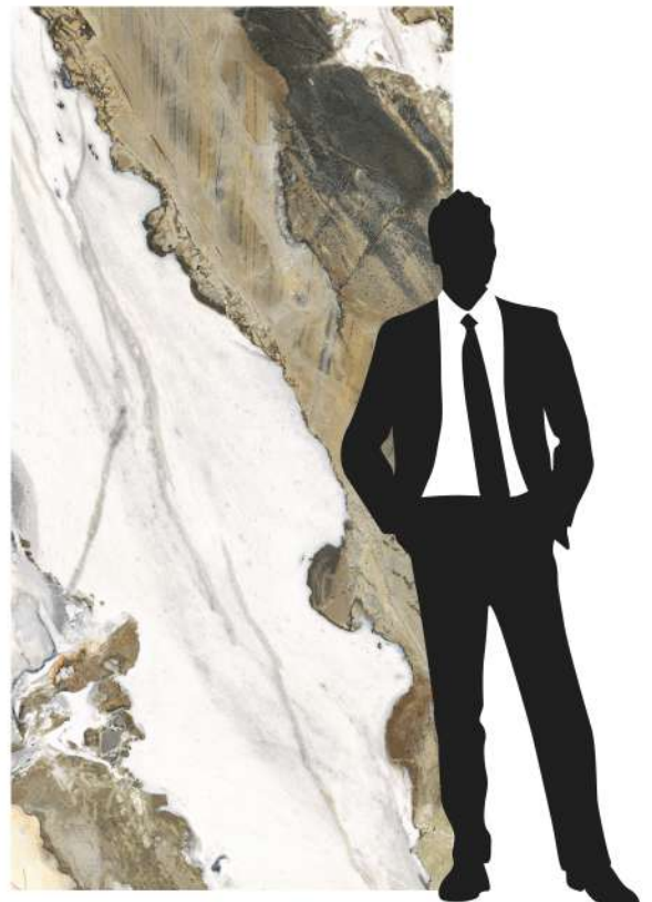
120 x 240