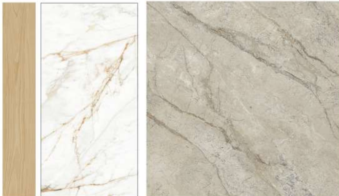
20 x 120 60 x 120